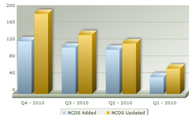
Systems Added And Updated

Exterro Fusion is an integrated solution suite backed by the full power of the Exterro Fusion workflow and data management platform. Its collaboration framework, dynamic workflow engine, secure ESI vault and audit trails enable efficient execution of end-to-end e-discovery projects. The Fusion Integration Hub allows all Fusion solutions to integrate with the IT infrastructure already in use, like HR or asset management systems, as well as other EDRM tools. With Exterro Fusion, legal and IT teams get the benefit of the legal industry's most trusted platform and its 360-degree visibility into and control over all litigation tasks and projects.